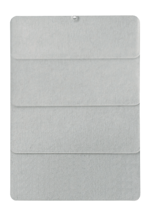
PS 7BA3037 FROSTED PS