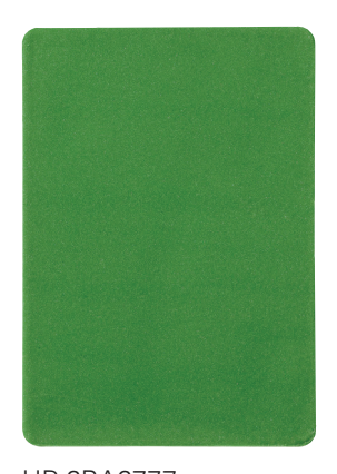
HP 6BA6777 GREEN LEMON SKIN