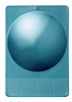
HP 5BA8857 BLUE METALLIC GLOSS