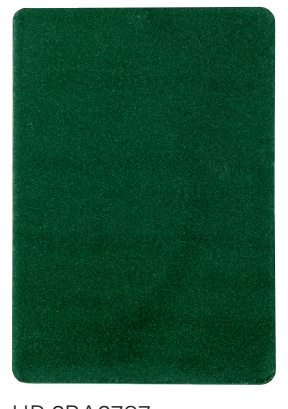
HP 6BA6787 DARK GREEN GLINT