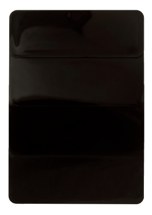
PP 7A7080SCR+HP 9B3127 SCRATCH RESISTANT