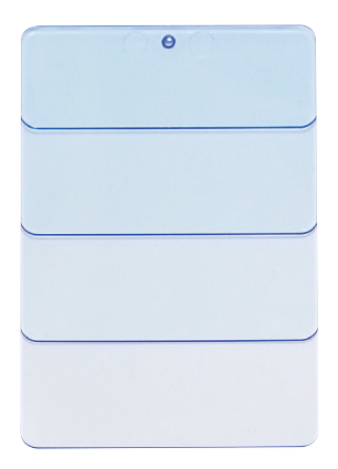
PS 5BA8887OB BLUE EDGES