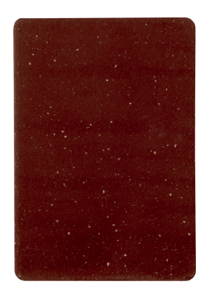
HP 8BA2247 RED BROWN TWINKLE