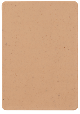
HP 8BA2207 OCHER SAND