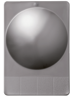
HP 7BA3017 SILVER METALLIC GLOSS