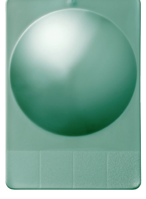
HP 6BA6757 GREEN METALLIC GLOSS