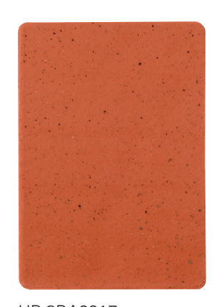
HP 8BA2217 RED NAMIB DESERT