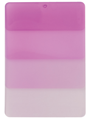
PP 5BA9217 UV SENSITIVE