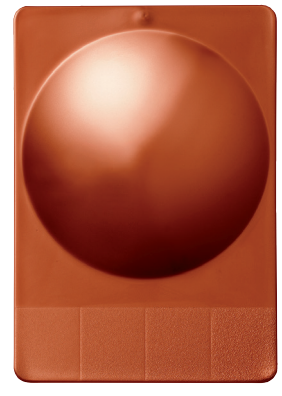
HP 7BA3027 COPPER GLOSS