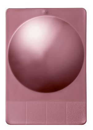
HP 4BA5847 RED METALLIC GLOSS