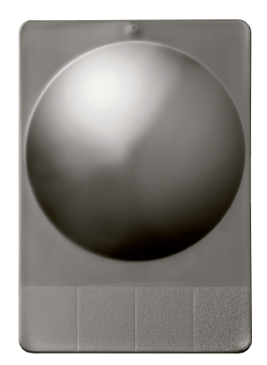
HP 755957 NICKEL SILVER