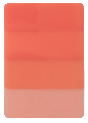
MPP 3BA2397 THERMOSENSITIVE