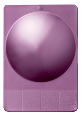
HP 5BA8847 VIOLET METALLIC GLOSS