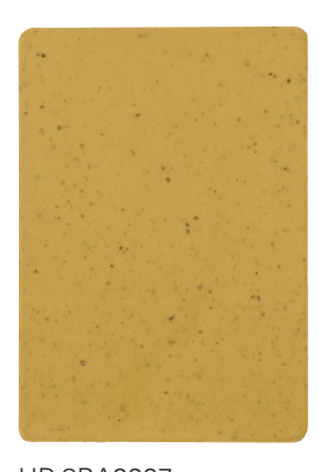
HP 8BA2227 SANDSTONE YELLOW