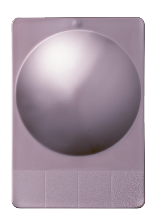
HP 5BA8837 LILAC METALLIC GLOSS