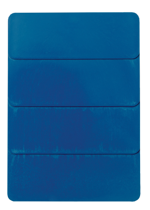
MPA 5BA8867 BLUE COOL PLASTIC