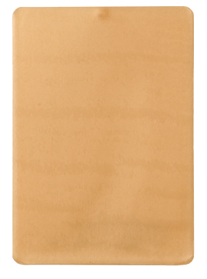
HP 755977 BROWN SUGAR