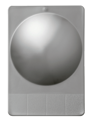
HP 7BA1467 SILVER GLOSS