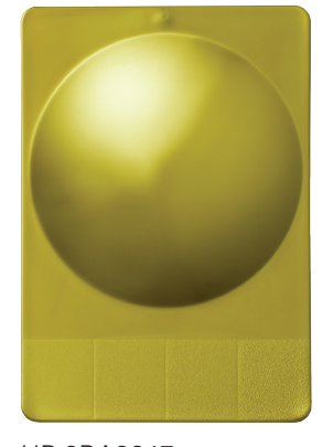
HP 2BA2647 YELLOW METALLIC GLOSS