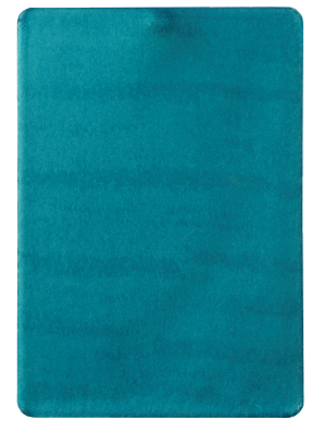
HP 5K4567 PETROL BLUE