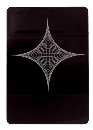
PP 9BA4307LS VIOLET LASERDESIGN