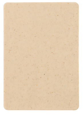
HP 2BA2207 PURE SAND