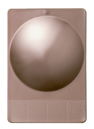
HP 3BA2297 BROWN METALLIC GLOSS