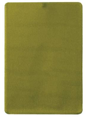
HP 6B3667 BIONIC GREEN