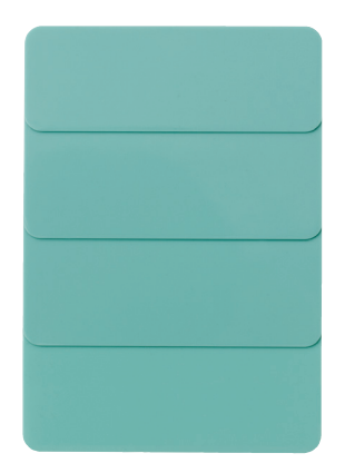
COC 5BA8877 SOUND OF GLASS