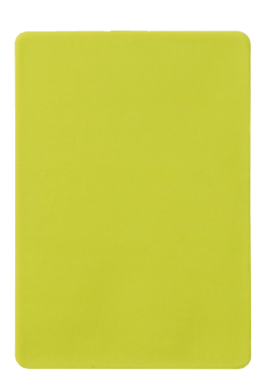
HP 6BA6797 CITRUS YELLOW GREEN