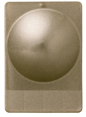
PP 7BA2477SG GOLD SPARKLE GLOSS