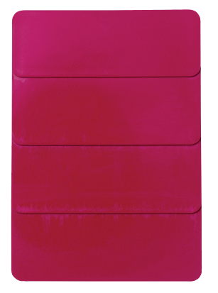
MPA 4BA5857 RED COOL PLASTIC