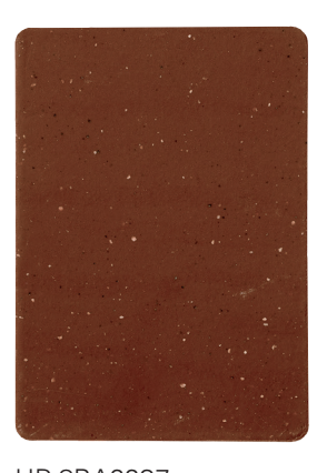
HP 8BA2237 COFFEE SPARKLE BROWN